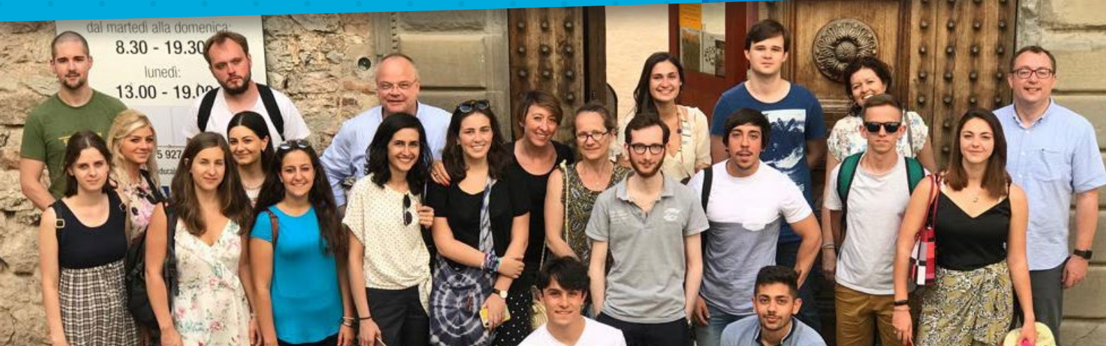
Students and lecturers from 15 universities in the FUCE network gathered in the medieval Italian town of Gubbio in July to learn about, discuss and question the ideas and experiences that give shape to the continent of Europe (see page 4).