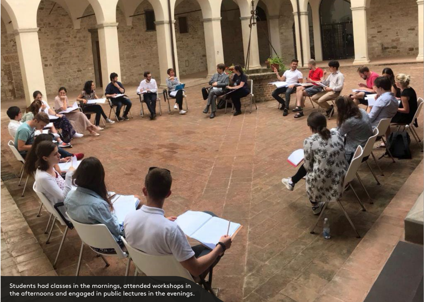
Students had classes in the mornings, attended workshops in the afternoons and engaged in public lectures in the evenings.